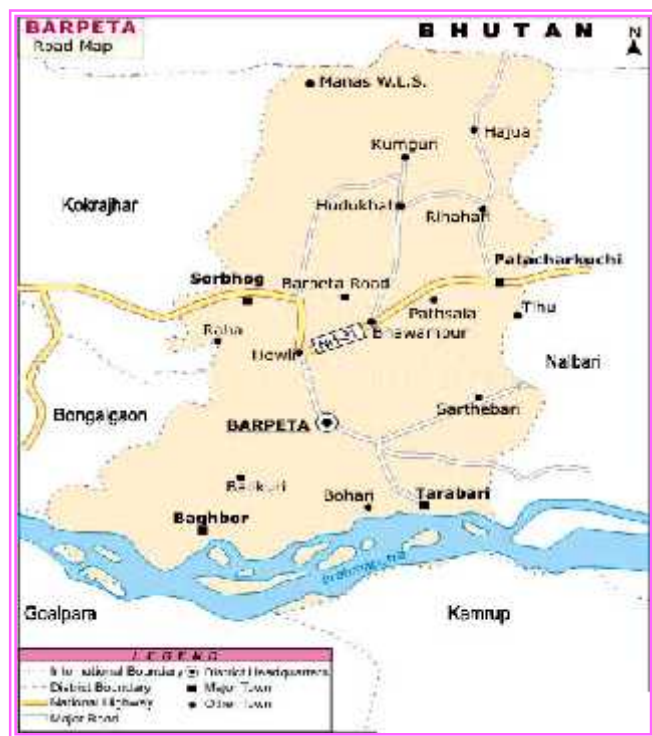
ANNEXTURE –I : MAP OF BARPETA DISTRICT